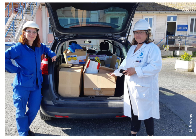
Employees from France

Inspired by this activity, employees in Lyon, France, also joined the effort, collecting vital aid that was transported to the site in Poland.