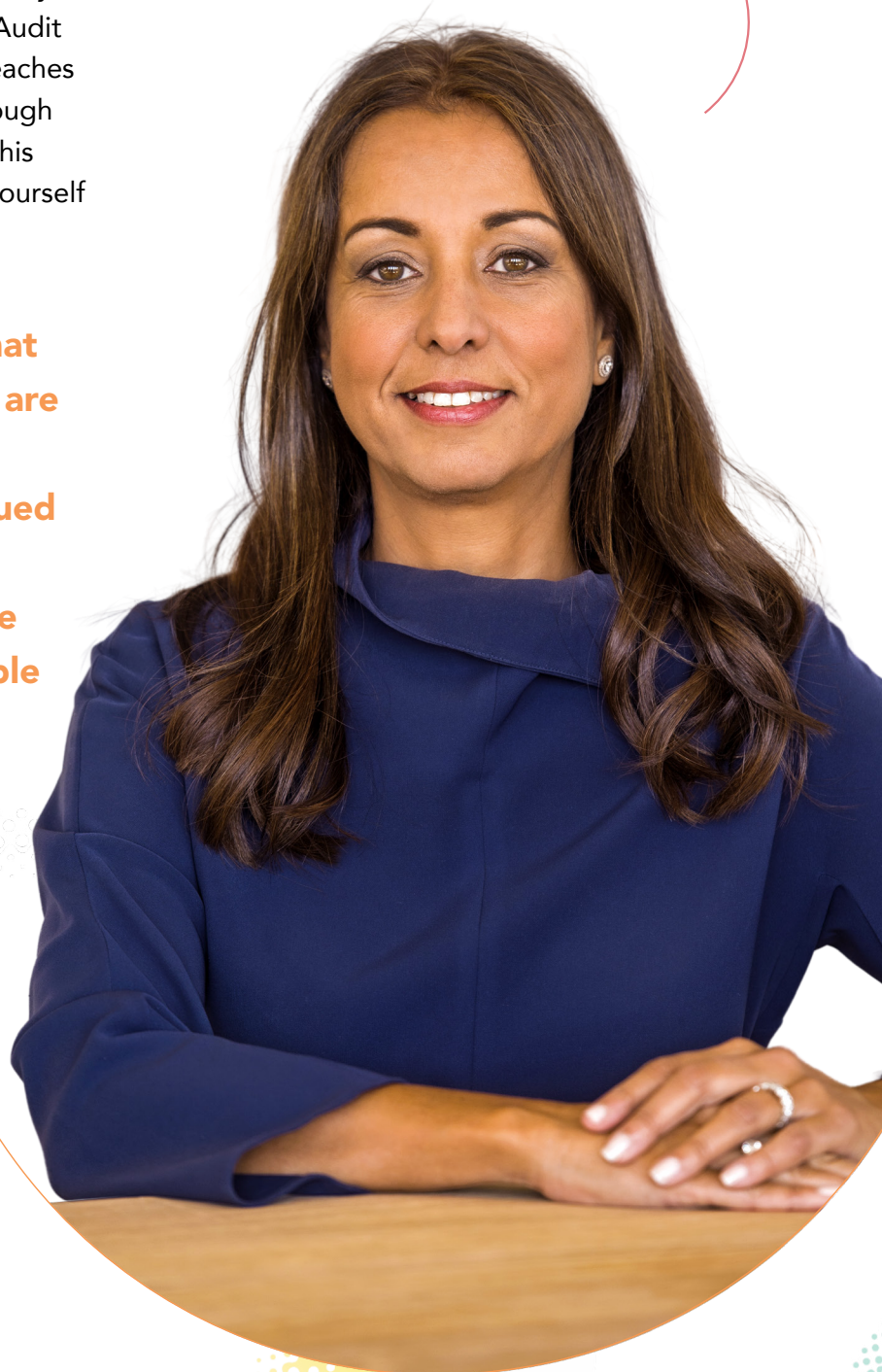
Ilham Kadri Solvay CEO

"I believe companies that put human dignity first are the ones that will last. Making people feel valued and respected for who they are, creates a more satisfying and sustainable work environment."