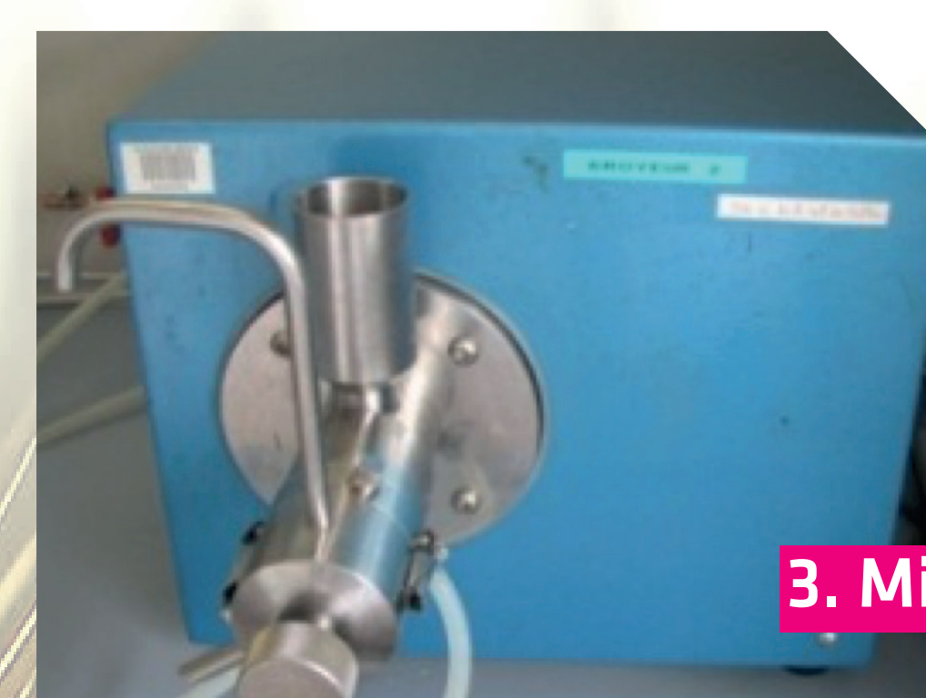
3. Mill it and pack it