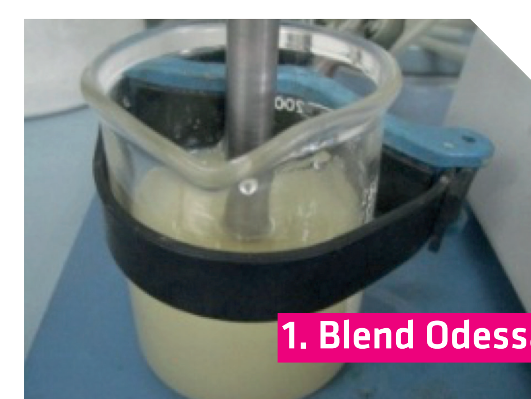
1. Blend Odessa + Oil