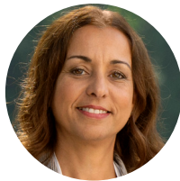
Ilham Kadri Solvay CEO & SSF Committee Member

The Fund is at the beginning of its journey, we will make sure to keep you regularly informed of the concrete interventions carried out through these progress reports.