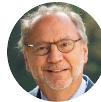
Peter Piot Honorary President

This Fund embodies what we are at Solvay, taking care of one another, alleviating the burden on our employees' shoulders, to enable them to focus on the essential and to give them reasons to be proud of belonging to this ONE community.