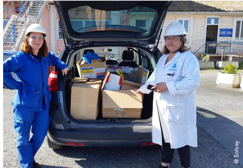
Employees from France

Inspired by this activity, employees in Lyon, France, also joined the effort, collecting vital aid that was transported to the site in Poland.