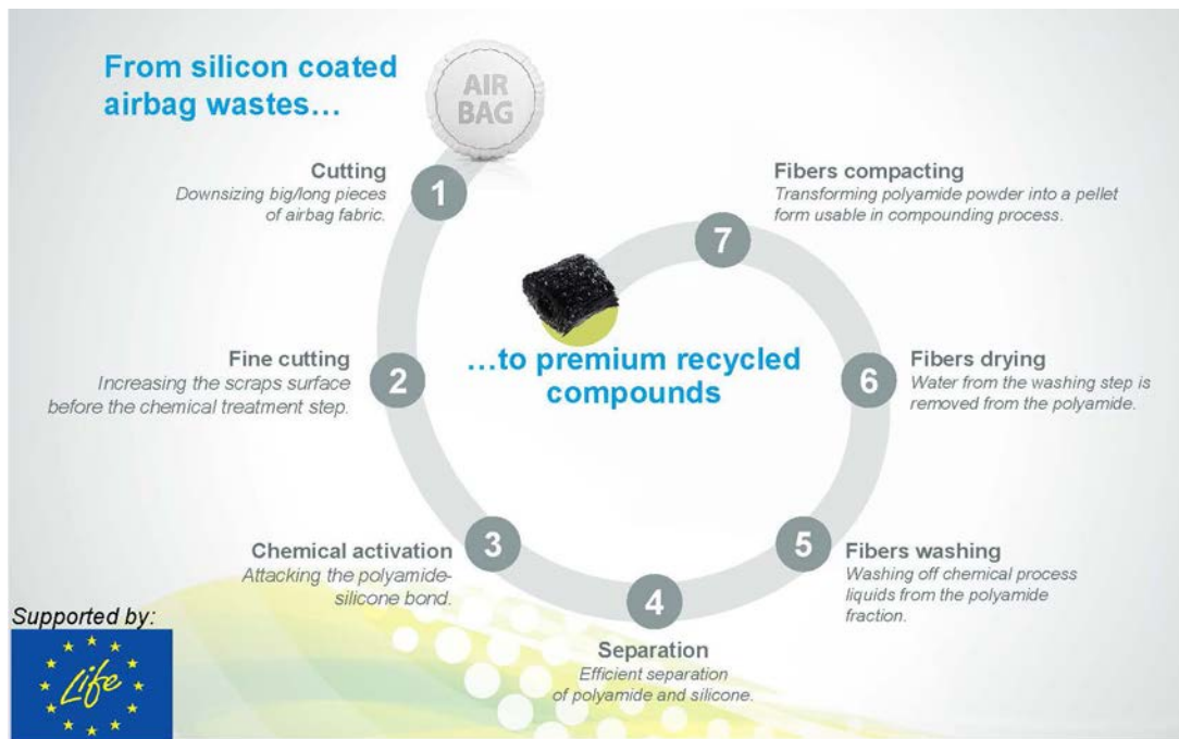
Diagram of the process